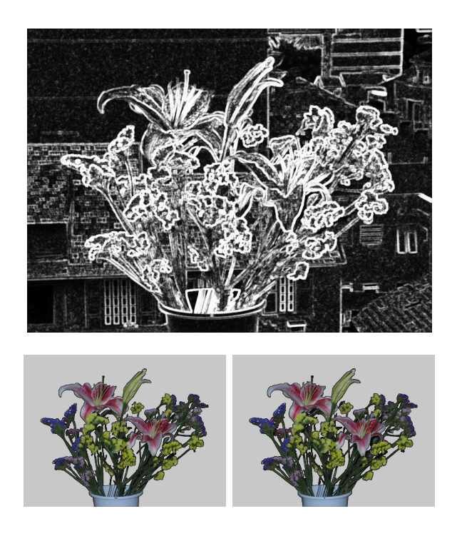
Figure 10. (upper)Boundary probabilities with \sigma_C = 5 . The resultant segmentation using different parameters: (lower-left) \sigma_L = 25 , \sigma_C = 10 , (lower-right) \sigma_L = 15 , \sigma_C = 5 .

The method is based on active illumination and employs graph cut optimization to segment the image.