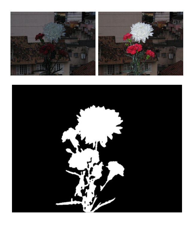
Figure 11. Input images and the final segmentation mask.

Concerning the operating range of the method, we point out that the active light source positioning is crucial to the method. It can be positioned in order to illuminate only the object to be segmented without affect the background. The discussion of how far the background should be for the