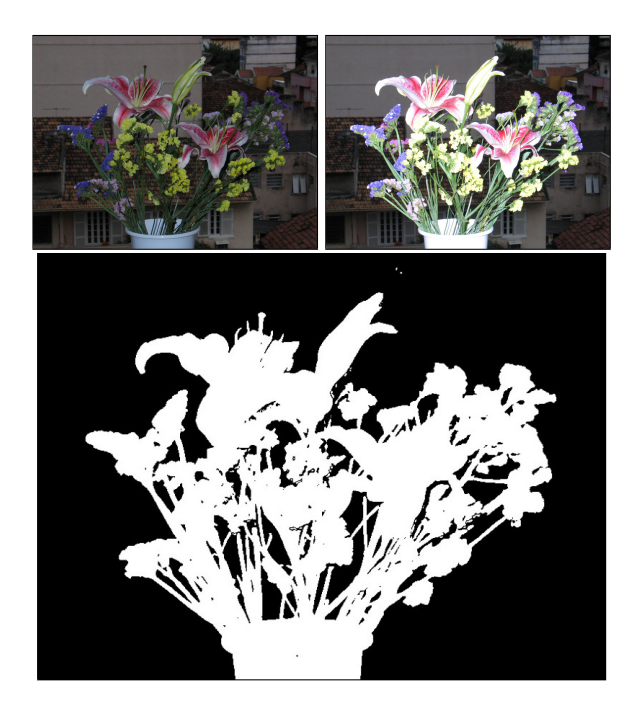
Figure 2. (upper-left) and (upper-right) are the input images differently illuminated by varying the camera flash intensity between shots, (lower) is the difference thresholded image.

As in [3] and [2], the energy function that we use is a discontinuity preserving energy function, obtained in the