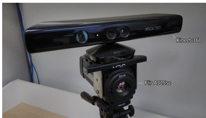
Fig. 2. Multimodal system of a thermal camera FLIR A325sc and an RGB-D camera Microsoft Kinect 360.

The software used for camera system connection are: ResearchIR (native FLIR software for images acquisition and display), MATLAB R2016a (high-performance development environment for numerical activities and software prototypes), and Kinect SDK 1.8. The multimodal system and the calibration method for the cameras capture the RGB-D-T images in order to map the areas which match. With that, it is possible