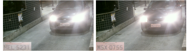
(a) RodoSol-ALPR (MSE = 174)

from the PlatesMania-CN datasets were downloaded from the internet [1], while \approx 39\% of the ChineseLP’s images were taken from the internet [30]. It makes perfect sense that the bias is less pronounced when the images come from multiple sources. The classifier still managing to achieve high accuracy rates in both datasets is due to selection bias [2], [5], [36], which arises because authors building a dataset select images with specific purposes in mind, thus reducing the variability of the data (in many cases without even realizing it). Furthermore, these datasets have images with different quality levels, as they were introduced years apart and the capture devices evolved considerably in the time between them being collected.