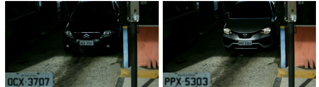
(b) RodoSol-ALPR (MSE = 407)