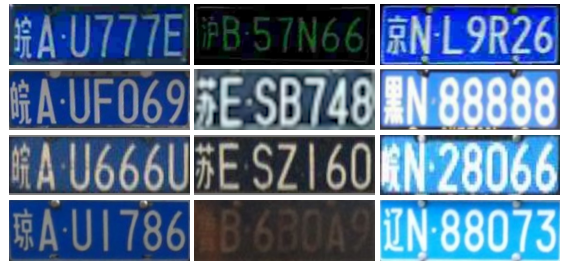
Fig. 2. Some Chinese LPs from the datasets used in our experiments. From top to bottom: CCPD [22], ChineseLP [30], PKU [31] and PlatesMania-CN [1]. The first character on each LP is a Chinese character representing the province in which the vehicle is affiliated. The second character is an English letter representing the city – in the province – in which the vehicle is affiliated [1].

datasets that do not contain such labels (only the CCPD and RodoSol-ALPR datasets have corner annotations for all LPs). These annotations are also publicly available 5 .