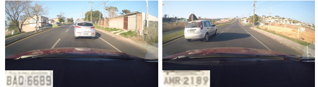
(d) UFPR-ALPR (MSE = 1,700)