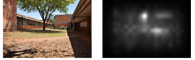
Fig. 6. Overexposed image, captured with 1/800 time exposure (left), and its corresponding saliency map (right).

(right). The salient areas (closer to white) should not be penalized as harshly as the non-salient areas. To create the final saliency map, we apply a threshold to the pixel values in this map, i.e. pixel values with saliency values greater than this threshold will be classified as pixels-of-interest. This final saliency map will work as a filter in the combination process.