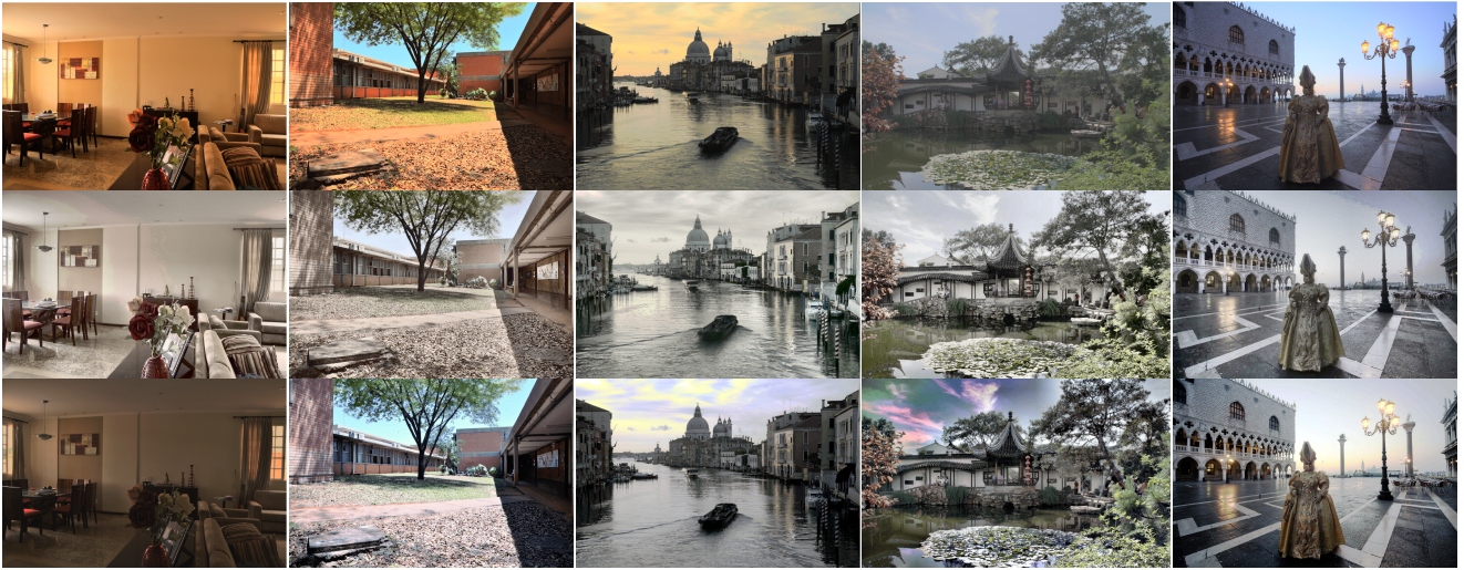
Fig. 7. Images showing the results obtained using: Paul Debevec (first row), Matlab (second row), proposed algorithm (third row).

words, we have to transform the HDR map of radiance to a default domain that can be understood by LDR displays.