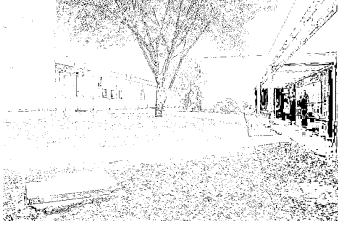
Fig. 4. Pixel Error Map for images in Fig. 3.

2) Saturation : Saturation is an important feature to take into account when combining images with different exposures. As mentioned earlier, these photos generally have overexposed or underexposed pixel areas that may be saturated towards ‘0’ (dark areas) or towards ‘255’ (bright areas). In order to obtain areas with a higher degree of details, these kinds of pixels must be penalized in the combination phase. This is achieved by creating a saturation map using the following equation: