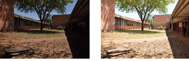
Fig. 3. Photographies captured with 1/3200 (left) and 1/400 (right) time exposures.

where \epsilon is a parameter defined by the the image variance. These differences determine which pixels are aligned with the correct exposure time. If a given predicted pixel has a big difference when compared to the original, this pixel gets a high value (closer to white) in the error map , while if the predicted pixel has a small difference it gets a small value (closer to black). Fig. 4 shows an example of an pixel error map corresponding to the images in Fig. 3.