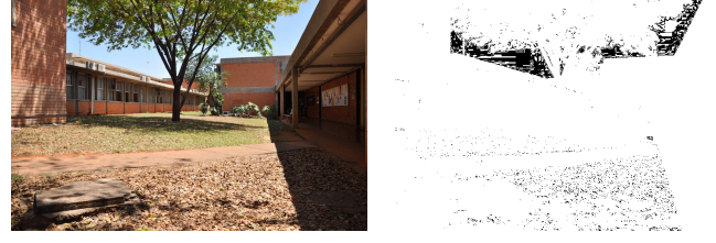
Fig. 5. Overexposed image, captured with 1/800 time exposure (left), and its corresponding saturation map (right).

3) Saliency : Salient areas are the regions of a scene that capture viewer’s attention. The Saliency map can act as a weight map that penalizes only the pixels in areas with less visual importance. Therefore, using a saliency map in the combination stage can improve the quality of salient areas. To create the saliency map we use the Graph-Based Visual Saliency algorithm [5], which uses bottom-up characteristic of the image to obtain a map in which salient pixels have higher values (whiter). Fig. 6 shows an image (left) captured with 1/800 time exposure and its corresponding saliency map