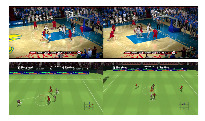
Fig. 7. Example of video class Team Sport : (top) NCAA Basketball 10; and (bottom) College Lacrosse.

descriptor for gameplay genre video classification.