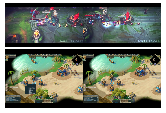
Fig. 1. Example of video class Real Time Strategic : (top) League of Legends; and (bottom) Age of Empires.