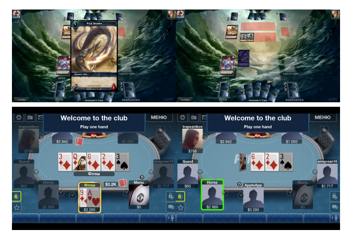
Fig. 2. Example of video class Card : (top) Shandow Era; and (bottom) Texas Poker.

Fighting (Fight): Adams [27] declares that fighting games require physical skills, such as reaction reflex and timing. For these aspects it can be seen as a subclass of action games. The game mechanics consist of combats using fighting techniques. The player usually combats another player and in certain cases, with the machine. Fig. 3, presents two examples of videos from this class.