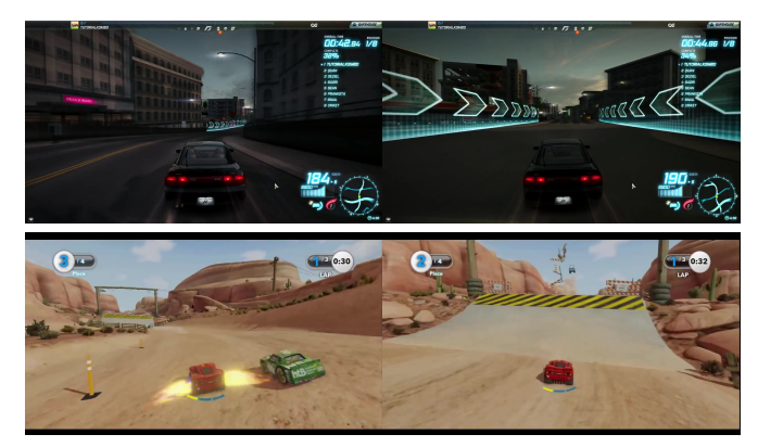
Fig. 5. Example of video class Racing : (top) Need for Speed; and (bottom) Car Alive.

items and confronting enemies. Fig. 6, presents two examples of videos from this class.