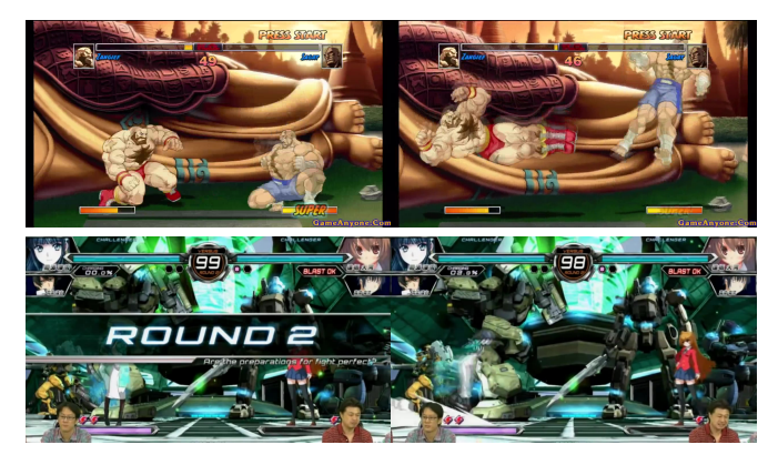
Fig. 3. Example of video class Fighting : (top) Super Street Fighter; and (bottom) Dengeki Bunko.

Side-Scrolling (Side): Present in several of earliest video game platforms, side-scrolling or platforms consist in an avatar moving forward and backward with limited abilities, collecting