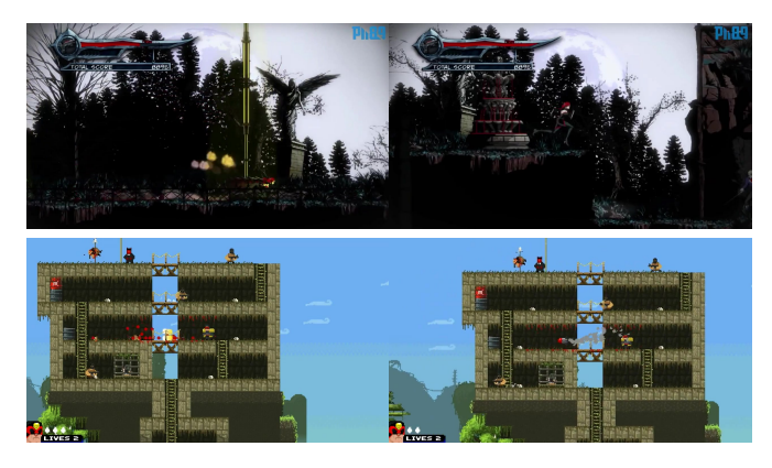
Fig. 6. Example of video class Side-Scrolling : (top) BloodRayne Betrayal; and (bottom) BroForce.