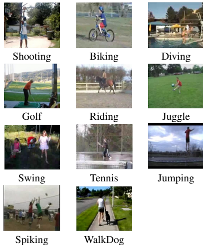
Fig. 3. Examples of videos from UCF11 dataset [18].

The UCF11 dataset [18] (also known as UCF YouTube) consists in 11 action categories extracted from Youtube video sequences. The sequences can vary regard camera motion, viewpoint, background, illumination and object appearance, pose and scale. The dataset contains a total of 1168 sequences (Figure 3).