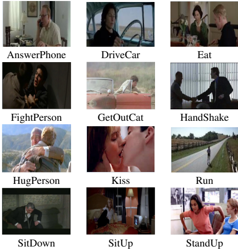
Fig. 4. Examples of videos from Hollywood2 dataset [19].

The mean difference of classification of each class is 4.9 \pm 4.8 , with 99.0% of confidence. So, we can conclude that our descriptor improved significantly the recognition rate.