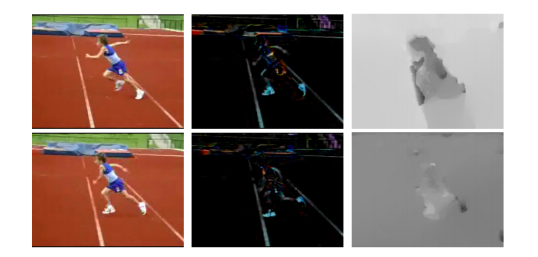
Fig. 2. Comparison between the three different types of input data: RGB (left), RGB difference (center) and optical flow (right).

Recent works have explored other possible substitute inputs for the temporal stream since the computation of dense optical flow fields is impractical in real-time situations. In [21], the use of the difference of consecutive RGB frames as replacement for the optical flow is proposed. The RGB difference between consecutive frames can be considered a noisy estimate of the flow, indicating the regions where significant change is happening. A comparison between the different types of input data for the convolutional networks is shown in Figure 2.