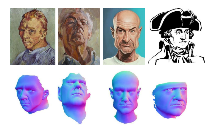
Fig. 11. Normal maps transfered from the proxies to images using our method. Note the smooth normal maps, even for images containing heavy brush strokes or just simple outlines. The proxies used for these examples were obtained from the same 3-D model.