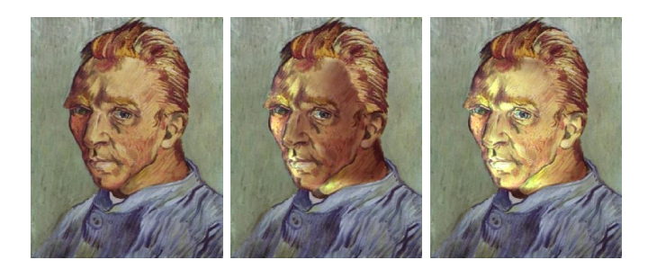
Fig. 4. Relighting of a Vang Gogh's painting. (Left) Original. (Center) Relit from the left using our artistic-relighting method. (Right) Relit from the front. Note how the shading-color relationship is preserved by our artistic relighting technique.

After performing image-model registration, one needs to establish a pixel-wise correspondence between the image of the object to be relit and the image of the shading proxy. For this, our technique matches a few key points and interpolates their positions to create a coherent correspondence mapping. The correspondences between key points are defined automatically (in the case of silhouettes, by using [30] and [31]) or interactively (using intelligent scissors [32]) if additional key points are needed. These corresponding pairs are used to obtain a Delaunay triangulation that defines a dense feature correspondence mapping between the image and the proxy.