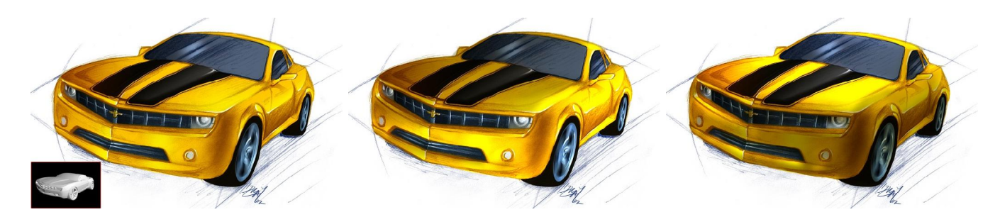
Fig. 6. Relighting of a Camaro drawing by Elisabeth K. (Lizkay). (left) Original, with 3-D proxy as inset. (center) Relit from the right. (right) Relit from above.

from the shading proxy to the input image. We exploit this possibility to transfer normal and depth maps from the 3-D proxies to pictures. Note that conventional techniques for estimating normal maps from images do so based on image gradients and, therefore, would not work for these examples. Our approach is capable of transferring smooth normal maps that capture the essence of different images, even when the proxies derive from the same 3-D model (Figure 11). This observation also applies to depth maps. Our technique can also transfer shading from proxies to drawings, giving a 3-D flavor to simple outline images (Figure 10).