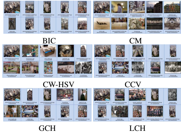
Figure 4. Query results in yahoo database. Top-left image is the query image.

Figure 3 has people in the query image. BIC and CCV retrieved very similar images in the first 20 results. All of them containing people. LCH, however, did not retrieved