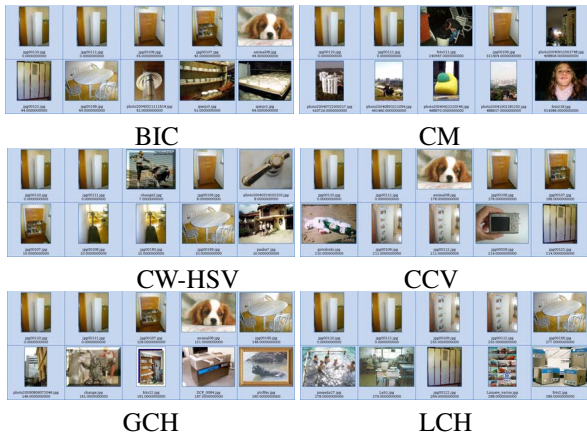
Figure 2. Query results in yahoo database. Top-left image is the query image.

In yahoo database we analyzed the retrieval effectiveness based on some query results. Figures 2, 3 and 4 show the first 20 retrieved images for each descriptor for three different queries. The top-left image is the query image.