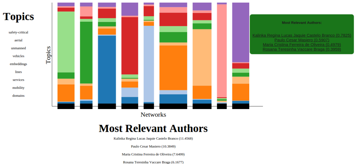
Fig. 1. Vizlattes layout: The relevant words of each topic on the left. The most relevant authors for each topic below. Each bar is a community and each color is a different topic. On the bounding box the relevant authors for the topic on that community.