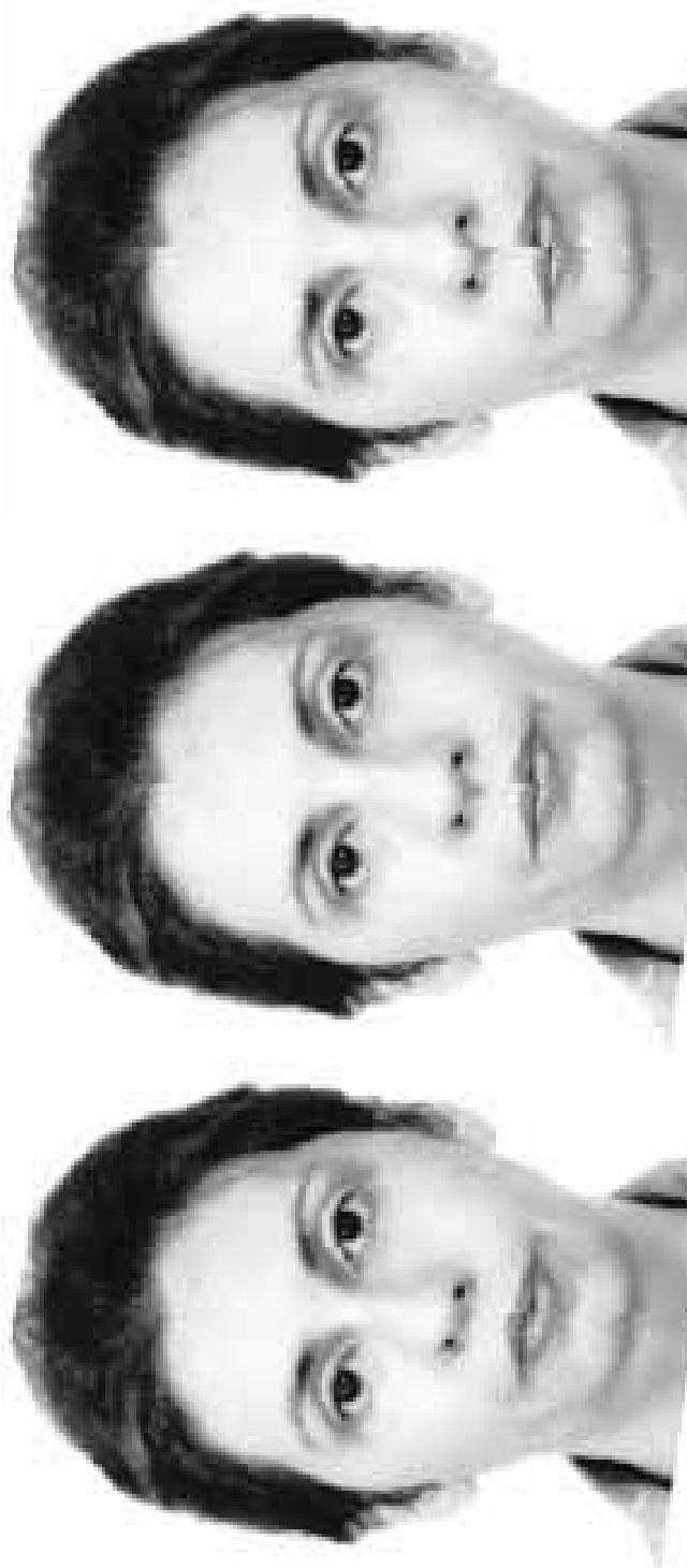
Figure 5.- The half-right real image (41 years) and half-left manipulated image (31, 51 and 61 years old)