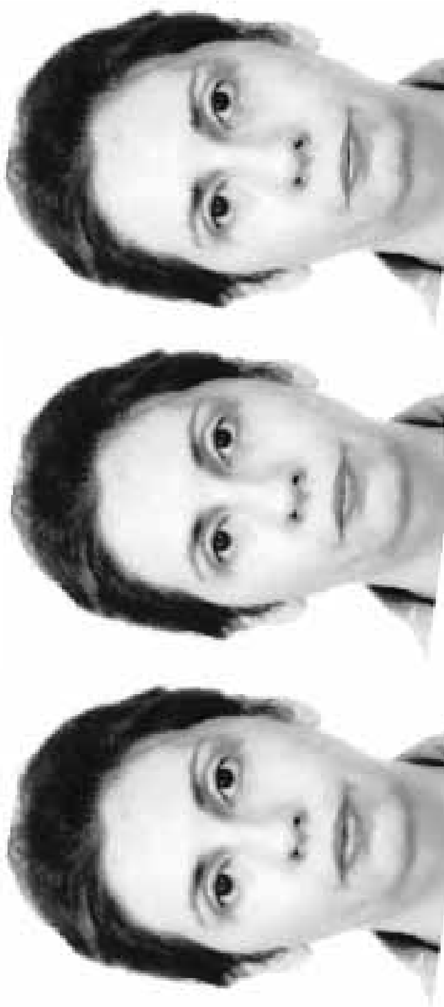
Figure 3.- Forward ageing, from 41 to 51 and 61years