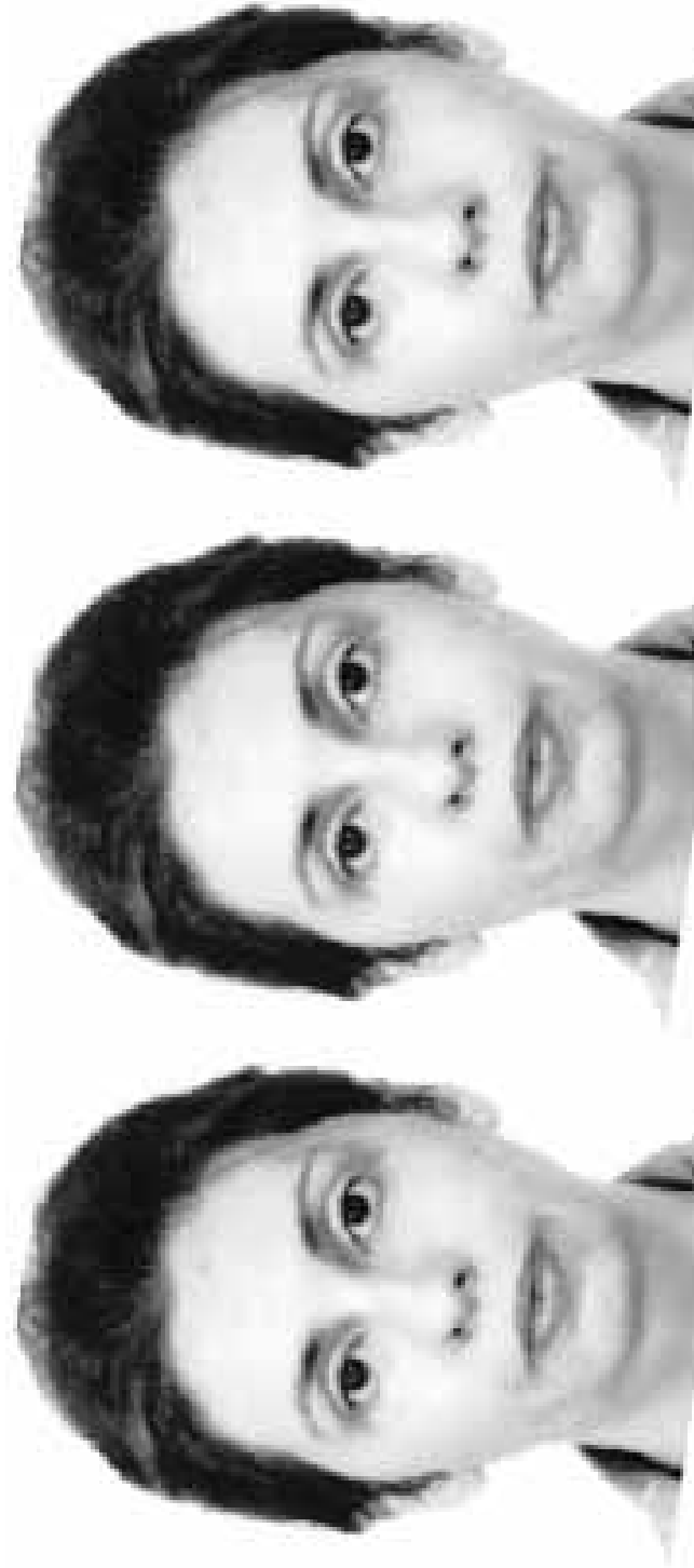
Figure 4.- Backward ageing , from 21 to 31 and 41 years