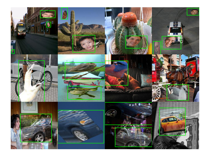
Fig. 2. Artificial detection samples on Faces, Birds, and Cars.

these GAN generated images. We finetuned and evaluated our detection models on the Stanford Cars dataset [21], with train/valid/test partitions equal to 7144/1000/8041.