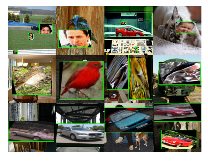
Fig. 4. Artificial detection samples generated without object segmentation (Naive Pasting).

3) Importance of GAN generation: So far, we have opted to use GAN generated object images at the first stage of