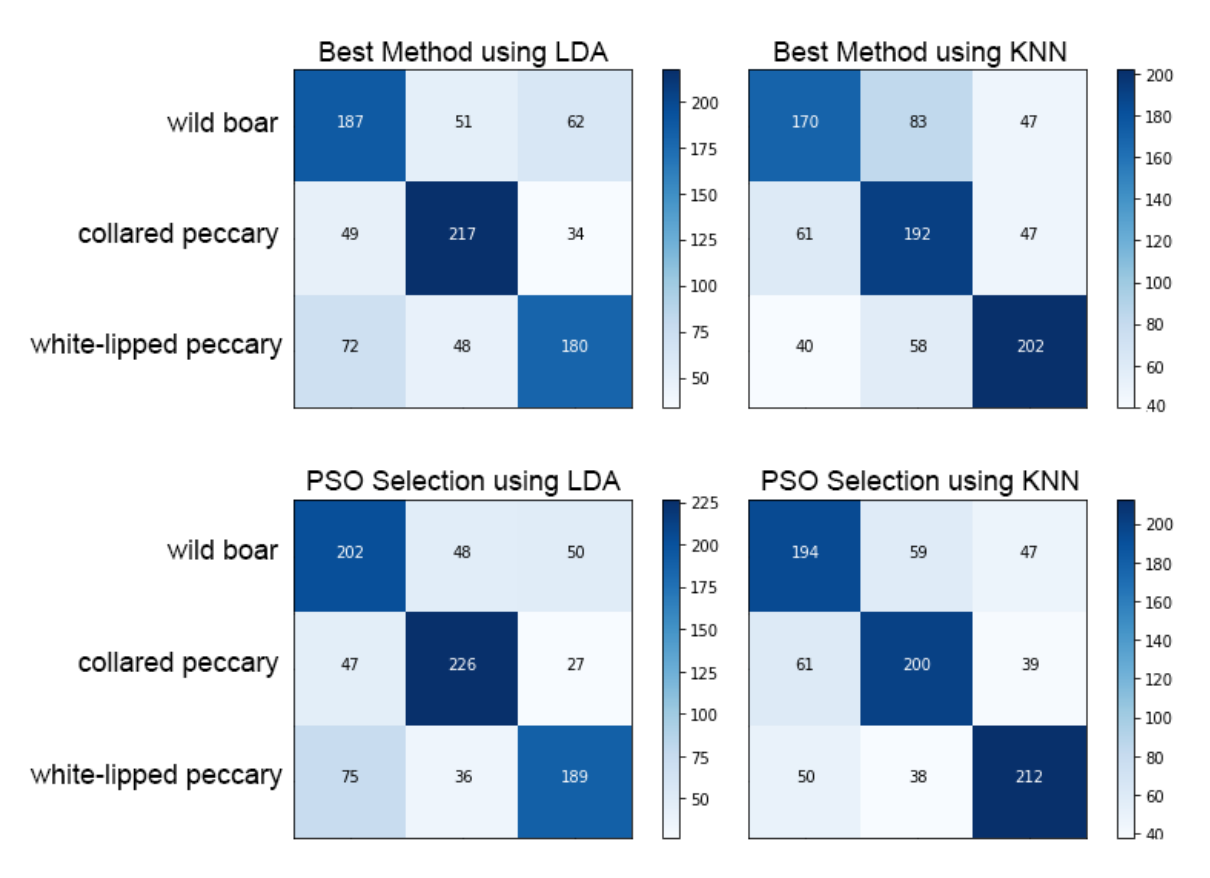
Fig. 2. Confusion matrices computed when considering the classification of animal species.