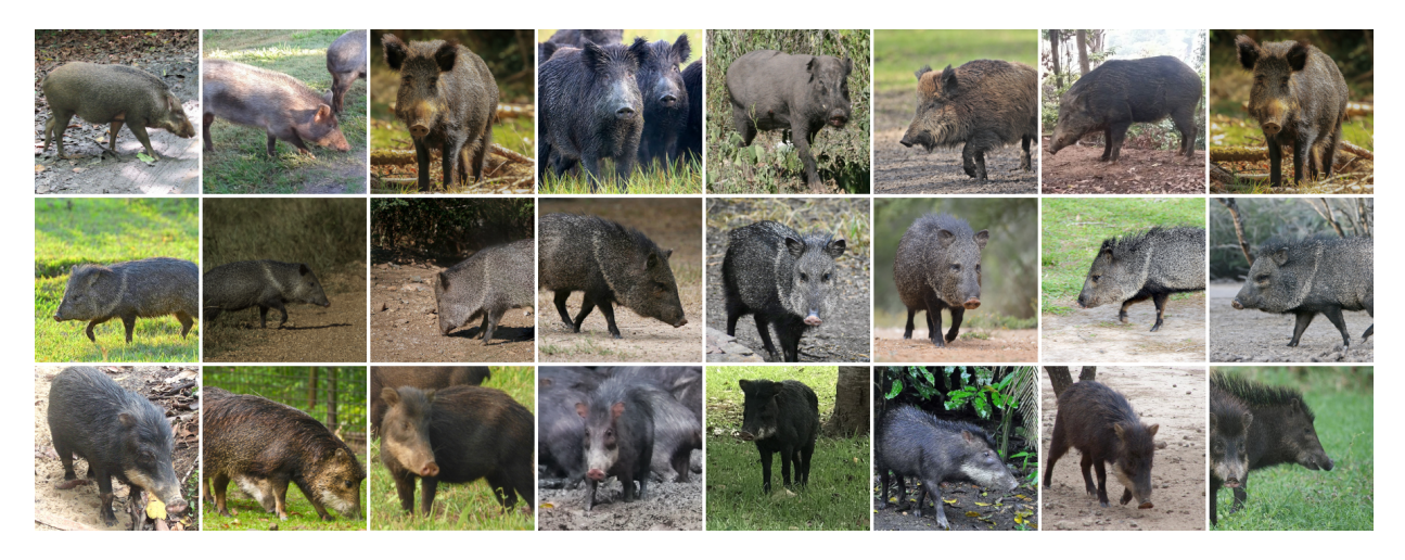
Fig. 1. Animal species in the dataset. From top to bottom row: wild boar (Sus scrofa); collared peccary (Pecari tajacu); white-lipped peccary (Tayassu pecari).

applying each mask to the input image we computed the local variance of the output, totaling 8 descriptors;