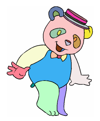
Figure 5. Image labeling through a flood fill algorithm.

In outline images, each region is made up of pixels inside a boundary curve. Given a point in an image, a flood fill algorithm recursively colors all pixels which are adjacent to this point and have similar attributes. When applied to binary images, the algorithm finishes when it finds all pixels internal to a region's boundary. If we scan a binary image running this algorithm to non-colored pixels, we are able to extract all the image regions. As colored pixels are not considered in the scanning process, this approach has an efficient O(n) cost, where n is the number of pixels. The Figure 5 depicts an image labeling process where each area is colored with a different color.