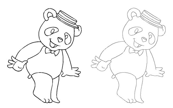
Figure 2. The skeletonization of the figure on left removes extra pixels and produces a simper image (right).

In images consisting mainly of lines, it is the position and orientation of the lines and their relationship to one another that conveys information. Extra pixels are unwanted information that complicate the analysis, and removing them is desirable [12]. To facilitate the extraction of image features, a thinning algorithm erodes, therefore reducing objects without changing their topology. For example, consider the bear images in Figure 2, both of them have the shape of the same cute bear, but the image on the right has the extra pixels removed and can now be further analysed for shape.