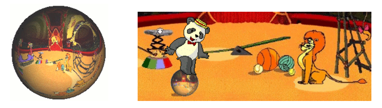
Figure 9. A sphere mapping technique applied to a 2D circle image(left). The image composed into an animation scene(right).