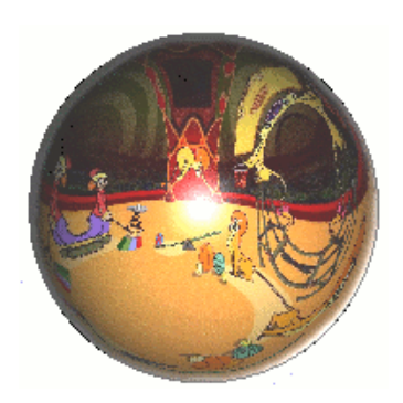
Figure 10. A circle simulating a chrome material and reflexion properties.

To enhance properties of a reflecting material, such as chrome, illumination model with diffuse and specular components must be applied to each image pixel. The Figure 10 illustrates a circus evironment reflexion into a circle that simulates chrome material and reflexion properties.