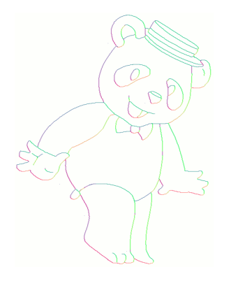
Figure 4. Normalized smoothed normal vectors in RGB space.