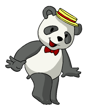
Figure 7. Lake's cartoon shading approach applied to a 2D animation frame.