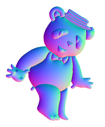
Figure 6. A normal image in RGB space.