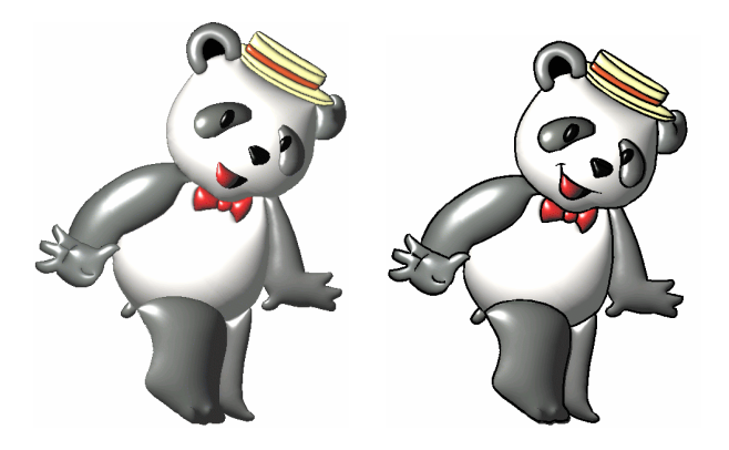
Figure 8. Images illuminated by a Phong shading. On the right image, silhouette and outline details are added.

If the animator informs the light position, we demonstrate that using an approximated normal vector field, 3D approaches for cartoon shading techniques can be applied on 2D images. The Figure 7 depicts the result of applying Lake's et al. approach to a 2D character where its surface normal was obtained through our preprocessing 2D images pipeline.