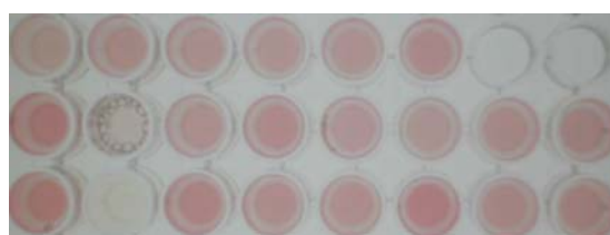
Figure 1. Sample image of cholesterol on ELISA plate

An ELISA plate was used to capture a digital image with cholesterol samples (Figure 1). The image was converted into gray scale. On that image, the wells were segmented and their gray intensities were measured on scale from 0 to 255. That measure was mapped to cholesterol concentration obtained from the spectrophotometer reading.